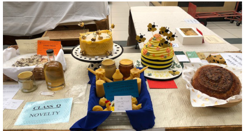
A variety of entries in the Novelty class