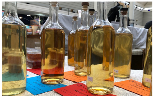
Mead bottles galore!