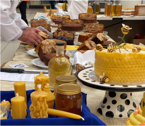
A wonderful display of cakes and candles!