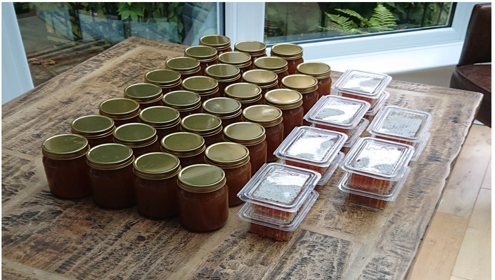
Hamish Low sent in this photo of the heather crop he has obtained from just two hives this August!

Please wear face coverings to follow anti-Covid-19 guidelines. See the price list on page 4.